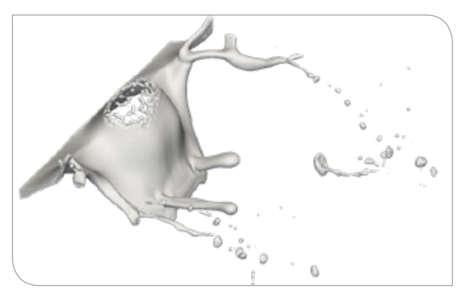
Spray in the virtual test rig