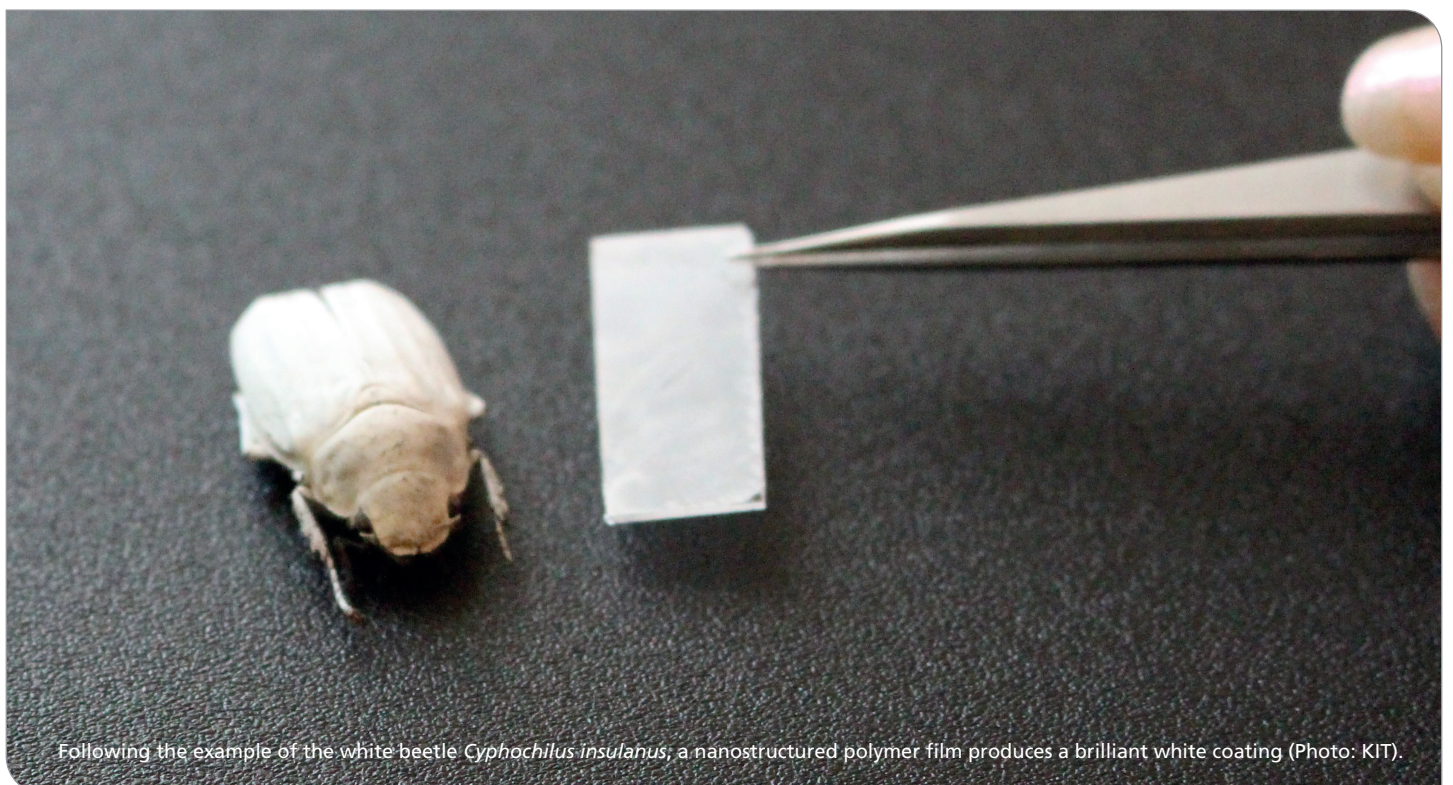
Following the example of the white beetle Cyphochilus insulanus , a nanostructured polymer film produces a brilliant white coating.

We avoid the use of environmentally and health-damaging pigments by producing porous polymer structures with comparably high scattering. The process is biomimetically inspired by the white beetle Cyphochilus insulanus , whose scales appear white thanks to their special nanostructure. Based on this model, solid porous nanostructures, which resemble a sponge, are produced from polymers. The polymer films produced by using our process can be applied industrially to various products. The extremely thin, yet mechanically stable polymer structures are characterized by a high scattering efficiency and consequently by a brilliant white appearance. The new technology permits a cost-effective and harmless white appearance and can be applied to a wide variety of surfaces.