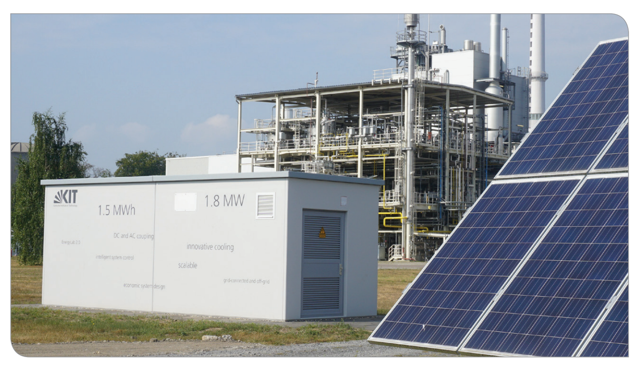
Large-scale storage system at KIT's solar power storage park

the Energy Lab 2.0. The thermal component activation of the concrete building as well as the use of the groundwater for temperature control of the batteries allow minimization of the operating and maintenance costs of the system and ensure a long lifespan. The required space for storage systems is reduced by the proportionate sinking of the building into the ground. The acceptance of the building as a storage facility in residential areas is enhanced by the attractive design. The robust building also makes the system suitable for installation under unfavorable weather and adverse environmental conditions. The hardware, if equipped with the appropriate software packages, is suitable for variable applications. This includes the primary operating reserve to compensate volatile-generated (i. e., time-, location- and weather-dependent) electrical energy or industrial applications (compensation of peak loads). The storage system is scalable in its rated power and storage capacity. Therefore, various requirements can be met.