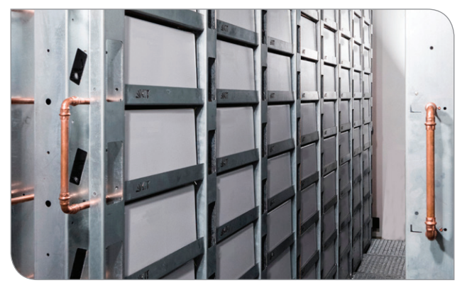
View into the battery room

The storage system supplies 1.5 MWh of energy and consists of 608 battery modules. With a nominal DC voltage of 710 V, up to 800 kW of electrical power can be achieved. The interconnection of two independent battery and converter systems offers important advantages. The storage system continues if a component fails: a special partial-load operating mode increases the service life and overall efficiency.