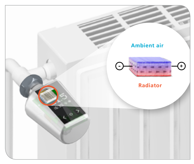
Thermoelectric generators for the autonomous supply of measurement electronics, such as a smart radiator thermostat

The patented thermoelectric generators commercialized by otego are the result of several years of research and development at the Light Technology Institute (LTI) of Karlsruhe Institute of Technology. otego GmbH was established last year and currently works on the commercialization of the generators. Work of otego's interdisciplinary team covers the complete value chain from the development of materials to generator production and its electronic connection.